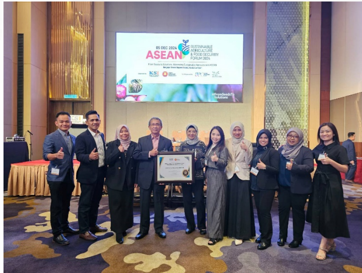
All Cosmos received "the Special Business Excellence Award" for Sustainable Agriculture Award.