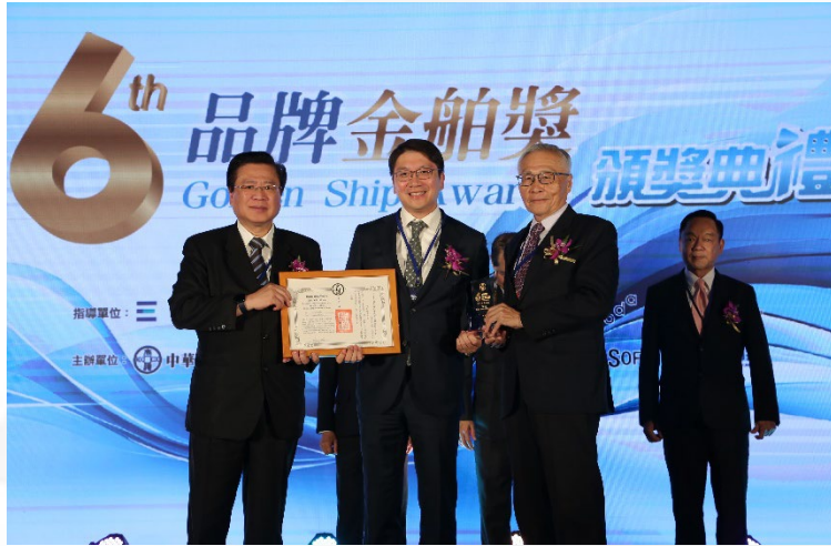
Subsidiary GKB received "2024 Golden Ship award" by General Chamber of Commerce