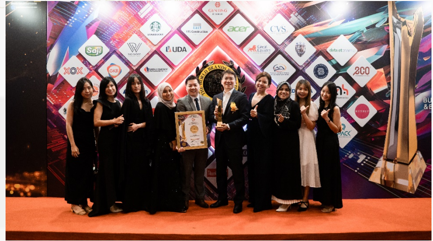
Subsidiary GKB received "Best Health Food Brand Award in Malaysia"