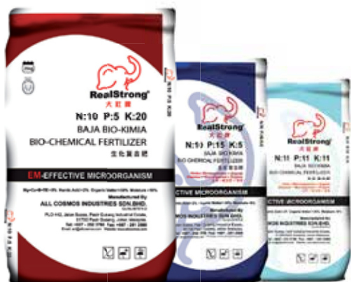
MAX 99 Max 33 Max Growth